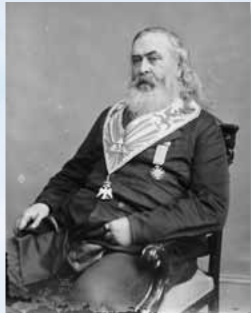
Pictured here in a portrait by famed Civil War photographer Mathew Brady, Bro. Pike had too many titles to list and was honored throughout the world as a man and Mason. Pike is the only Confederate military officer or figure to be honored with a statue in Washington, DC.

When the Mexican-American War started, Pike joined the cavalry and was commissioned as a troop commander, serving in the Battle of Buena Vista. He and his commander had several differences of opinion. This situation led finally to an "inconclusive" duel on July 29, 1847 near Fort Smith, Arkansas. Although several